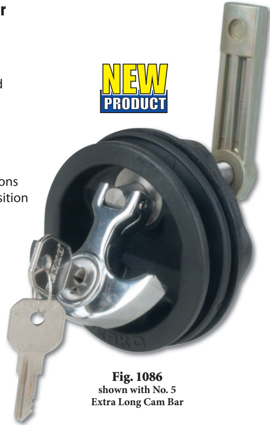
Fig. 1086 shown with No. 5 Extra Long Cam Bar