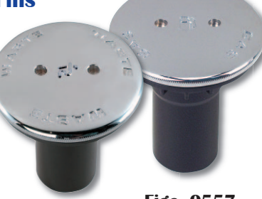
Fig. 0556 Waste Figs. 0557 Fuel or Water