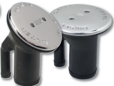
Fig. 0541 Diesel