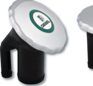
Fig. 0582 Diesel